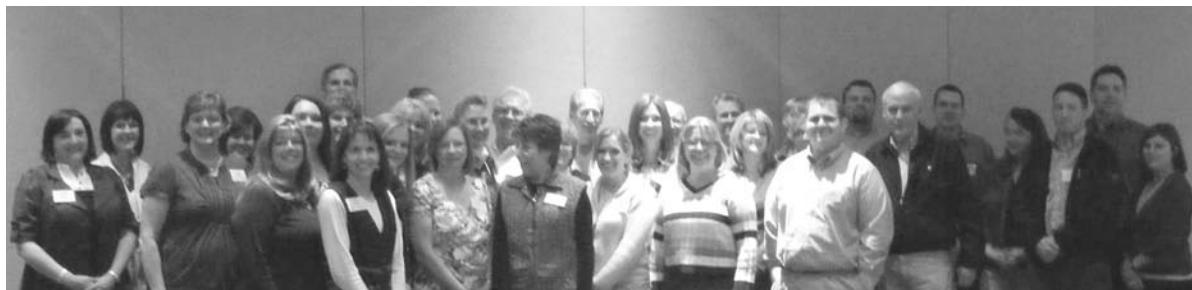
2009 BEAR Roundup

and described how the services provided by BEAR Teams provide helpful information to the Governor as well as the state of Montana.