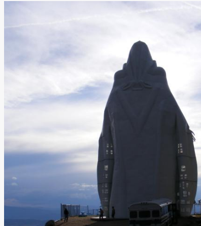
A view from the back.