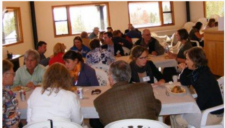
A traditional Pasty Dinner was sponsored by NorthWestern Energy.