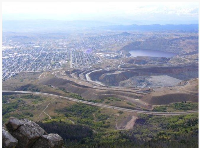
The view from the top.