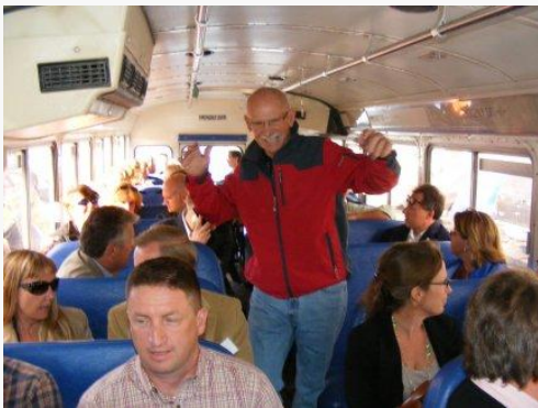
Our expert (and energetic) bus driver.

To truly showcase Butte, the Butte hosts planned a tour and dinner at Our Lady of the Rockies.