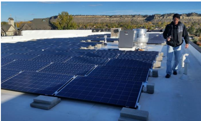
Image 1: 50 kilowatt solar photovoltaic (PV) array on a tire shop, Billings

Copies of the 2019 AERLP brochure are available for distribution to interested economic development agencies or businesses. For copies of the brochure, or for more information, please contact the AERLP manager at DEQ, Ben Brouwer 406-444-6586, bbrouwer@mt.gov .