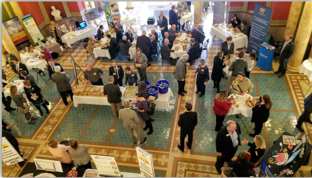
MEDA Day in the Rotunda January 23, 2019 * Slide Show

2019 Legislative Standing Committees * 2019 Session Home Page