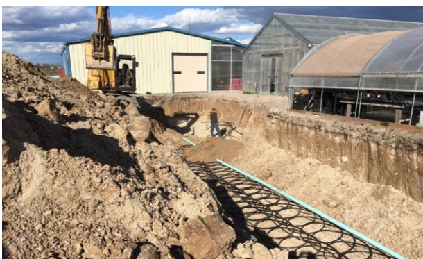
Image 2: Geothermal heat pump loop-field under construction at a landscaping business, Polson