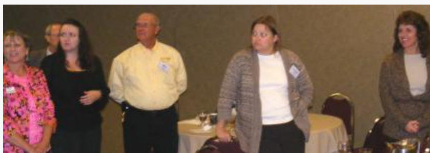
MEDA Members enjoyed the following breakout sessions: