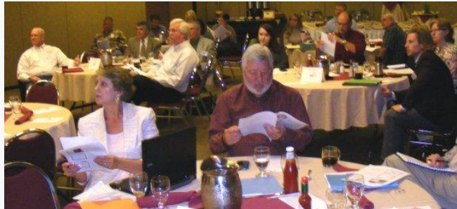
Professional Development Attendees