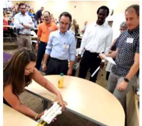
Team building infrastructure at MEDA.

Go to FAQ or https://arpa-mtdnrc.hub.arcgis.com/pages/commerce or call 1-844-406-2772 with your application questions.