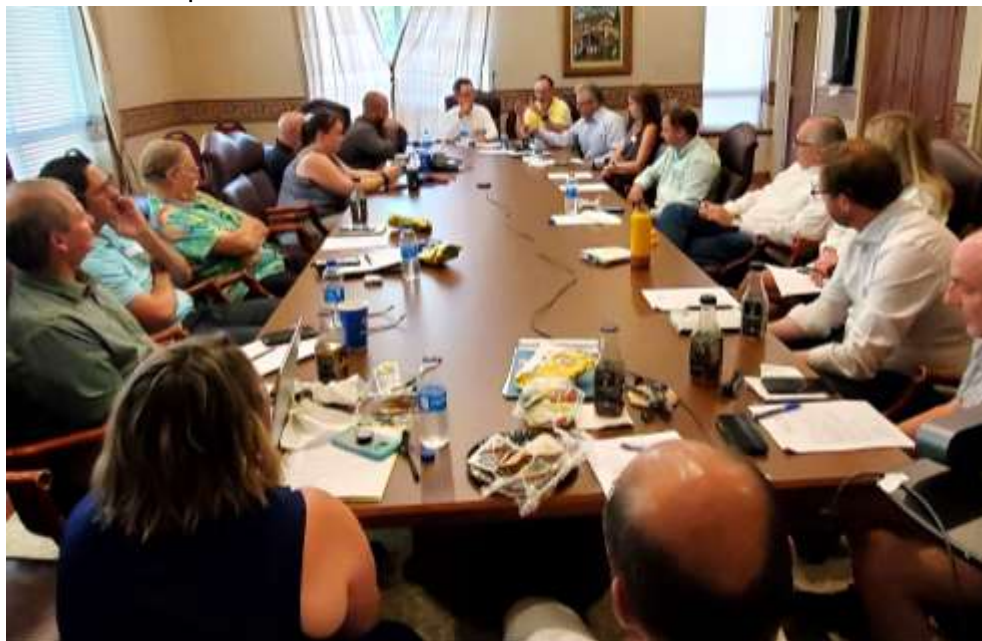
MEDA Board Meeting, Helena, MT

The MEDA Board is planning a retreat this summer that will solely focus on the organization of MEDA and follow up on all that was learned from the Summer Conference.