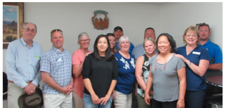
Poplar Phase 2 Community Review Team

If you have a community that is on the edge of making progress - but needs a little organization, encouragement, and resources boost - MEDA would love to work with you to make that happen via a Montana Community Review . For more information visit https://www.communityreview.org/ and http://www.medamembers.org/resources/community-reviews