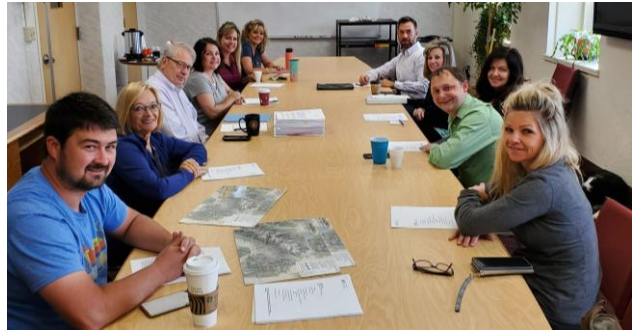
ALDC Board Members