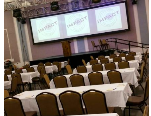
Setting the stage in Great Falls.

If you missed the summary of Montana Economic Developers Conference & Leadership Development Event Impact: Learning, Sharing & Partnering for High Performance view it here .