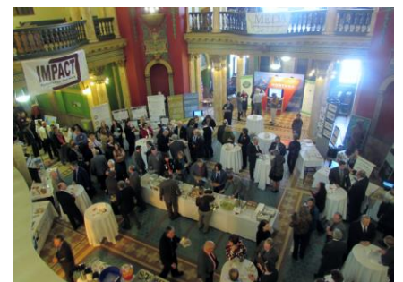
Members gathered for Rotunda Day '15